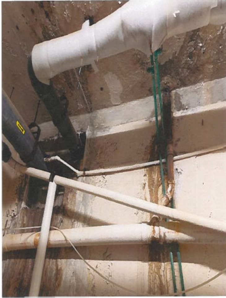
Pool Deck Floor Drain Leak